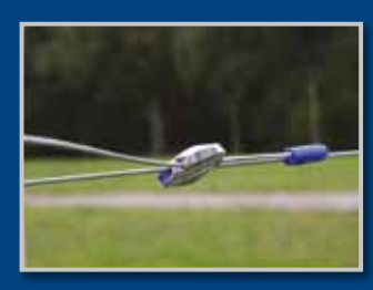
Join and tension wire using a Gripple Plus